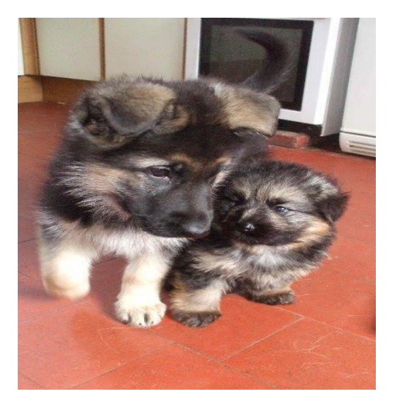
'Hobbit' and Normal Litter mate at age 8 weeks

The clinical symptoms of dwarf dogs are not limited to their visible appearance; they suffer from a whole range of detrimental hormonal conditions particularly from under development of the liver and kidneys causing chronic renal failure, cardiovascular problems such as Patent Ductus Arteriosus (PDA) and also for many a range of neurological conditions. The deficiency of Thyroid Stimulating Hormone (TSH) results in an underactive thyroid gland (hypothyroidism) causing many animals to be slow, dull with some aggressive tendencies due to the lack of TSH, this is not true of all dwarf dogs as many are alert and easily trainable as with a normal dog and with no temperament issues. Additionally the reduced level of gonadotrophins may result in failure of one or both testis to move or "descend" into the scrotum (cryptorchidism) in male dwarves while female dwarves do go into heat more often and for longer than normal but they do not ovulate, females are particularly prone to urinary tract infections.